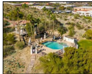
Vantage Pointe Pool

are allowed. Pets or glass items are always prohibited in the pool areas. When arriving and departing the pool area, residents are required to secure gates in a locked position. Propping gates open or tampering with the closing devices is prohibited.