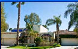
Gosnell Attached Garden Home

History: Our community is comprised of homes built by several different builders, with the units often referred to by the builder's name.