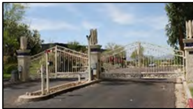
48th Street Gate

Our community has a gate on 48 th St. at its North entrance, and residents must enter a code into the gate's keypad to open/close the gate or use the PSMRA key fob. The key fob is available for purchase at Brown Community Management.